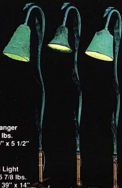
D1 Light Wt. 4 3/4 lbs. Size 39" x 14"